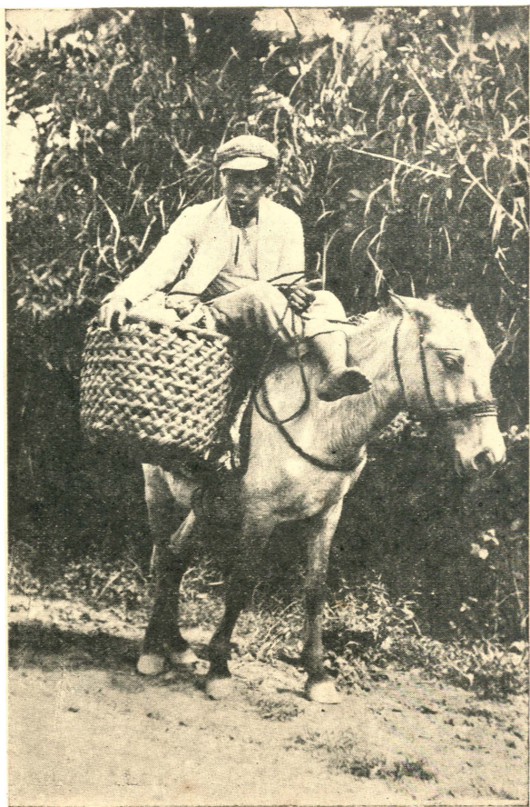
The Old Reliable