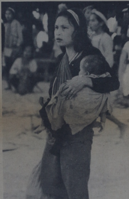
Native woman goes to class carrying child in her arms.