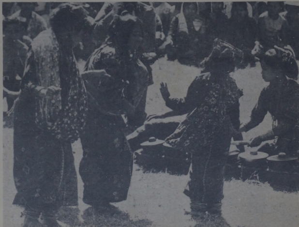
Natives in colorful costumes take part in community program.