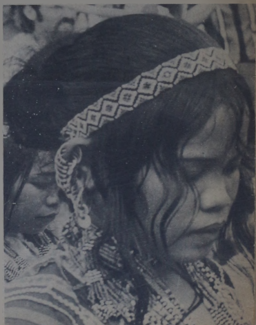
Bilingual program sets focus on teaching of children at earliest pos.

Pilipino and English. The program calls for technical and in-service training for teachers as well as authors of bilingual textbooks. The objective of the program is to integrate the ethnic groups into the mainstream of Philippine society by opening up avenues of communication between them and the government as well as with other sectors of the population, and at the same time preserving as much as possible their original lifeways.