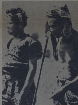
Tribesmen leave the field for the classroom.