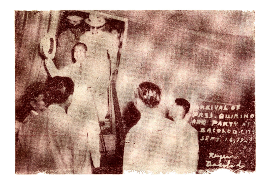
President Elpidio Quirino shown coming down a PAL plane in the Bacolod City airport during his last trip to the Visayas.

Considered to be the biggest event ever attended by the whole teaching force of Negros Occidental, was the three-day teachers convention last September 15, 16 and 17, in the City of Bacolod.