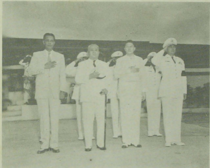
Later, senators visited Camp Murphy and were honored with parade and review by representative units of the Armed Forces. From left (above) are Defense Secretary Eulogio Balao, Senate President Eulogio Rodriguez, Senator Emmanuel Pelaez, chairman of Senate national defense committee, and AFP Chief of Staff Lt. Gen. Jesus Vargas saluting flag preparatory to inspecting honor escorts (below).