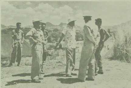
Emphasis on the barrio as the basic area for a continuing analysis and solution of problems relative to peace and order is now the added responsibility of the PC.

The Left Hand effort of the constabulary primarily concerns itself with projects designed to ameliorate the plight of the barrio folks through the extension of whatever aid the PC could give. The effort consists of psychological warfare action, all-out friendship, public relations, material assistance, and help for lawless elements who wish to return to a life of peace.