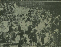
YOC PROBLEMS GROUP