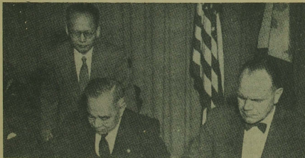
To push through their new program of subversion in the economic sphere, dissidents unleash a propaganda drive that includes a vigorous attack on government projects and even against the Laurel-Langley trade agreement signed last year in Washington, D.C.

3. Intensification of an extensive propaganda drive by fanning the flames of social unrest to create an atmosphere of nervousness and tense social discontent among the masses.