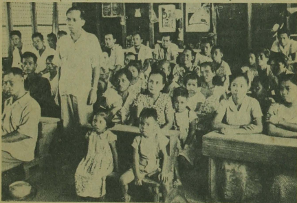
New Huk struggle, tagged as parliamentary struggle, aims at, among others, creation of election committees among barrio folks. Counter-measures and committees by the government can insure nation against new strategy being used by local Reds—the Huks.