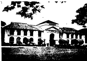
Philippine General Hospital

We often read of complaints and reports about the inefficiency of a certain hospital administration. But let us be more slow in our criticisms of hospitals. The unhappy