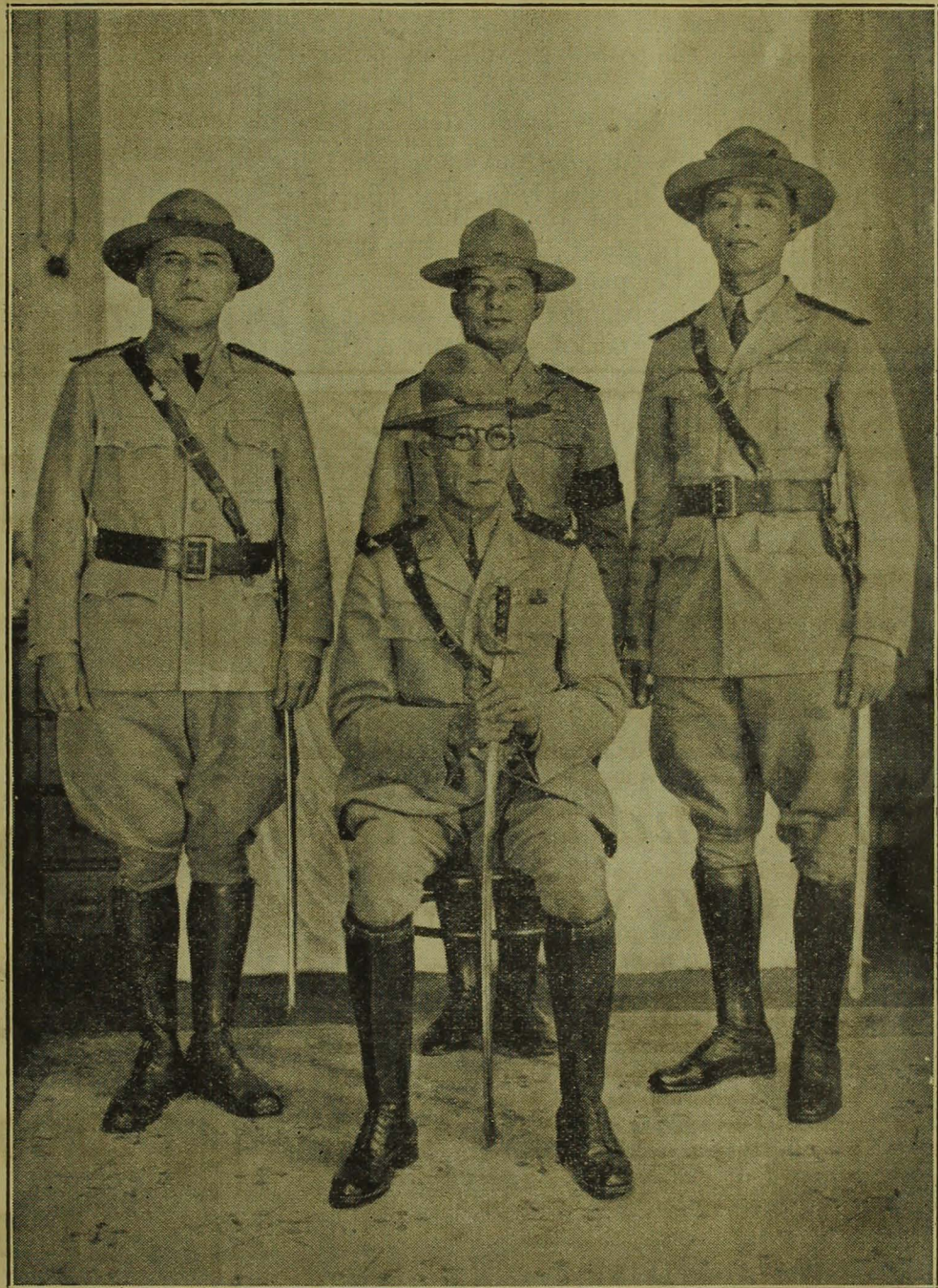
DISTRICT COMMANDER AND STAFF, DISTRICT OF SOUTHERN LUZON

Third Company, Virac, Albay; 29th Compa-