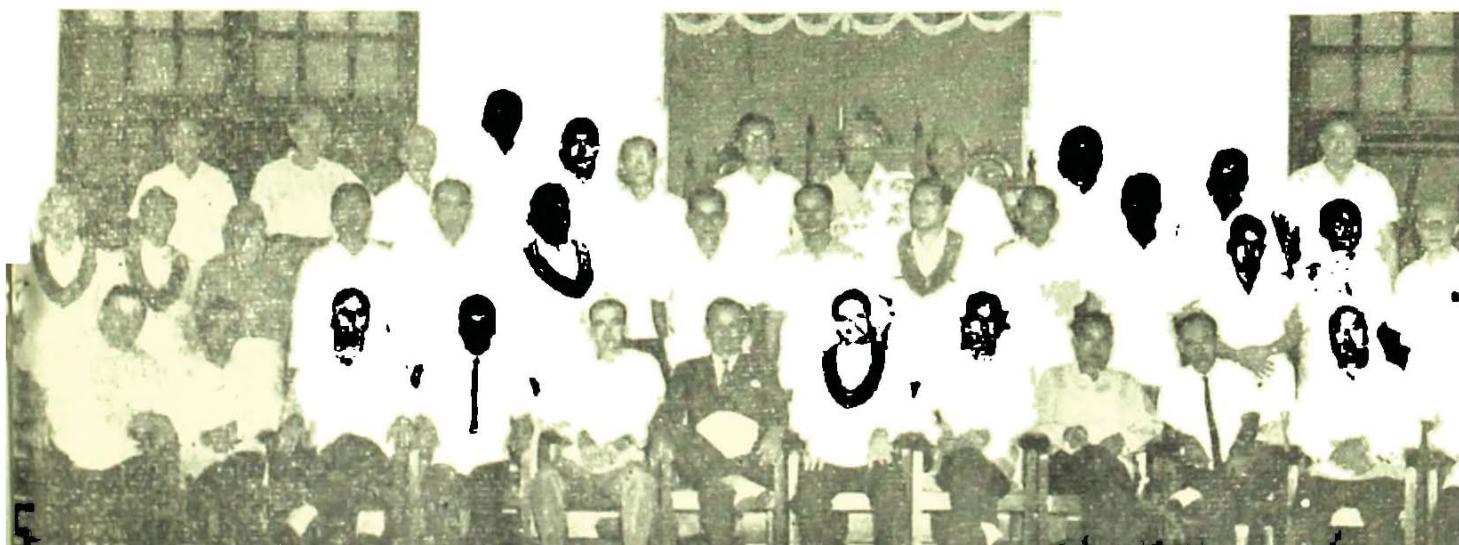
Below: Newly installed officers for 1964 of Cavite Lodge No. 2, Cavite City.