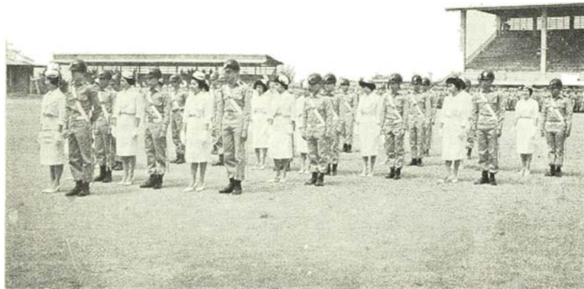
PRESENTATION OF SPONSORS

Friday, September 8 (which is the Foundation Day of the Society of the Divine Word), the University again celebrated the traditional Rector-Faculty Day.