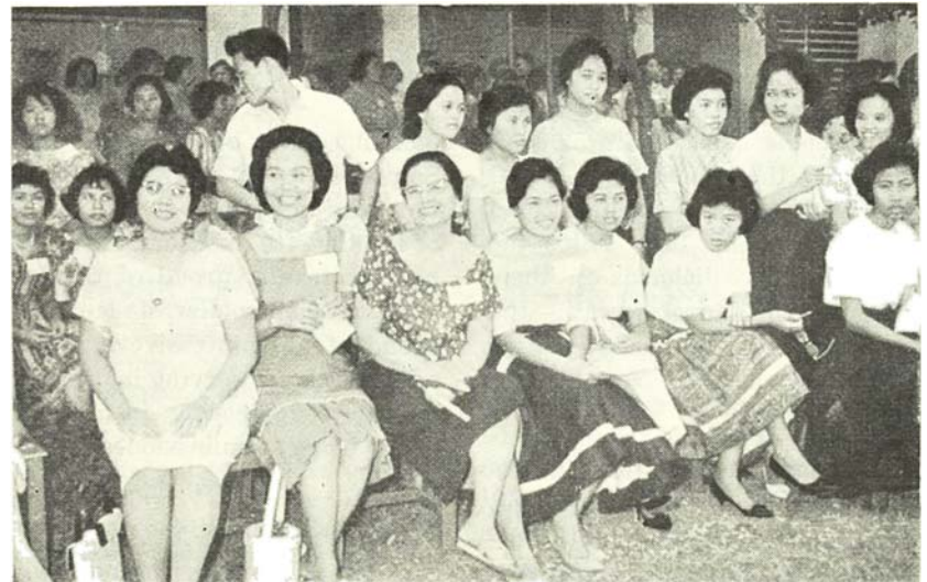
A SMALL SECTION OF THE CROWD AT THE FACULTY-STUDENT ACQUAINTANCE PARTY

Night work, however, will stop upon completion of the basement, the first of nine storeys, when the technical pro-