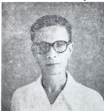
RAMON Z. ESTANISLAO Mayor of Dinalupihan, Bataan