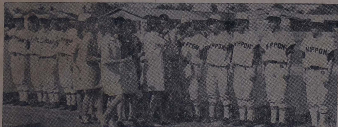
The Japanese players from Chiba, Japan (Kobayashi Secondary Team) receiving leis from local young beauties. Last Friday afternoon these boys returned to Japan by plane after completing a sweep of 8-game Philippine series, all to their credit.