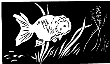
The Japanese Lionhead

Not all goldfish are gold colored. Almost all the colors of the rainbow may be seen among the goldfish. One specie which is differently colored from the rest is the Veiltail Moor Telescope. It is black.