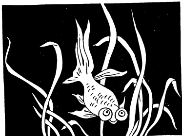
A near-sighted goldfish called Telescope goldfish.

Another species which was beautifully developed is the Fringtail. This goldfish has a tail fin twice as long as the fish itself.