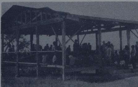
The use of field technicians to carry development messages hasn't worked too well.

College and the University of the Philippines' Institute of Mass Communications devised an information campaign model which they called the Participatory Campaign Strategy, or PCS.