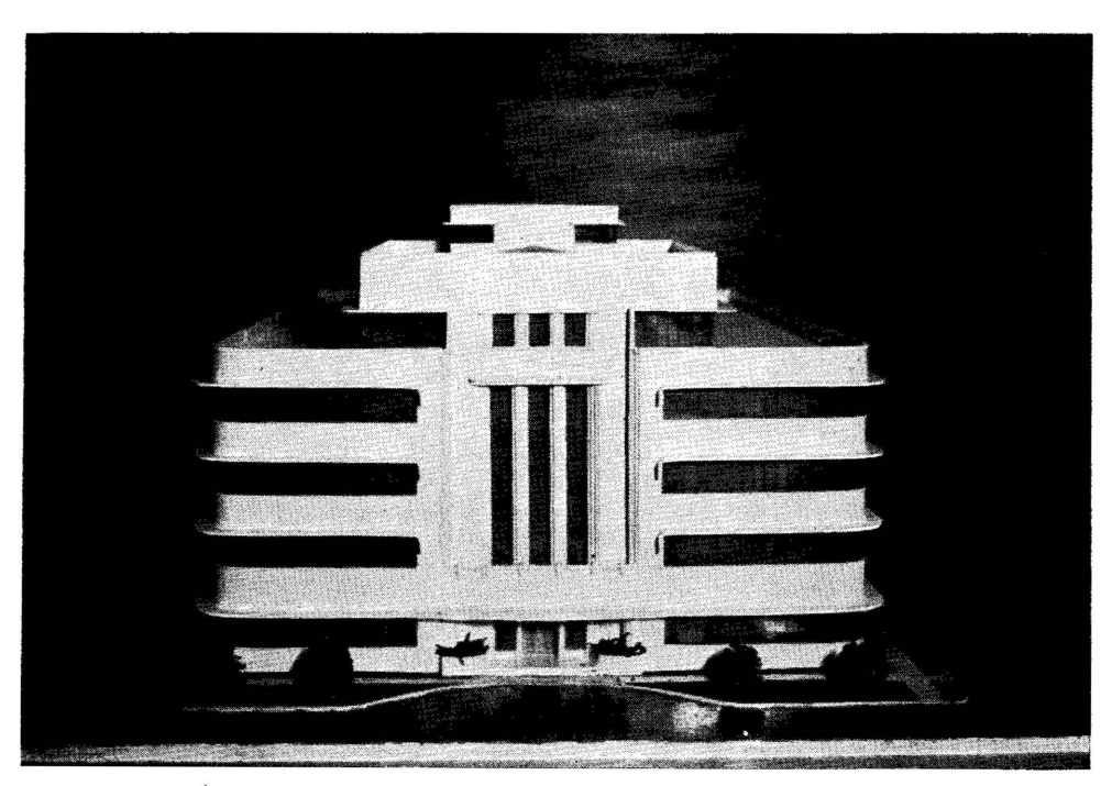
This is the front view of the model of the new Marsman Building. The structure is expected to be ready for occupancy in October.