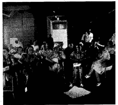
Moral and vocal support from the gallery for the bowling match.