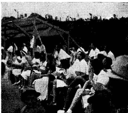
A portion of the crowd watching the baseball game at Paracale between Manila and Paracale.

Manila visitors left the Paracale country club with sure promises to return next year.