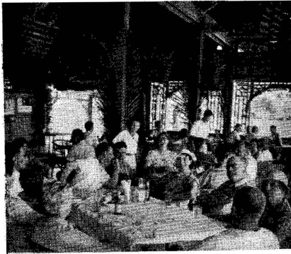
Sunday morning breakfast in the club.