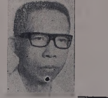
By: ELIX ABEJERO