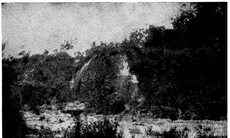
Native sluicing operations (Dayaks are very much like the Igorots of the Mountain Province of the Philippines.)