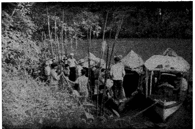
Motorboats and prahus being rearranged to go up the rapids