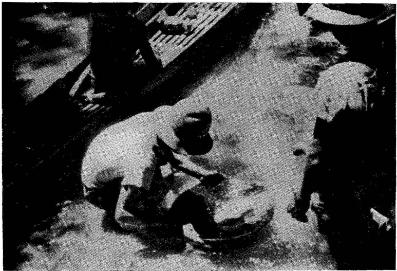
Panning in the river bed.