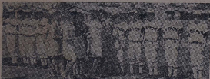
The Japanese players from Chiba, Japan (Kobayashi Secondary Team) receiving leis from local young beauties. Last Friday afternoon these boys returned to Japan by plane after completing a sweep of 8-game Philippine series, all to their credit.