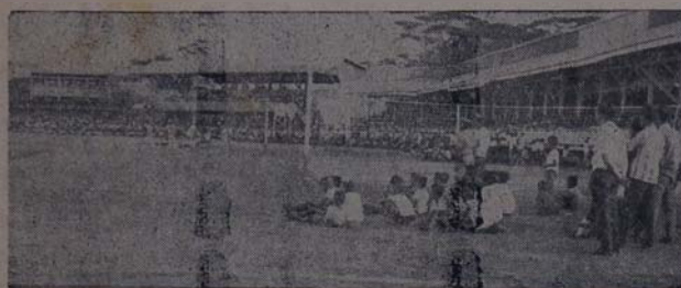
The picture here showing the huge crowd that filled the grandstands and bleachers at the Cam. Sur High School Campus.

Visitors Highly Applauded; Local Boys Did Best