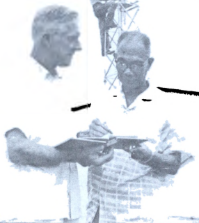
Tower of new DZUP radio station, inaugurated soon, goes up.