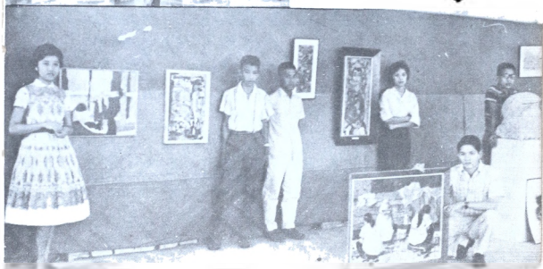
Winners of the Jubilee art contest display their pieces