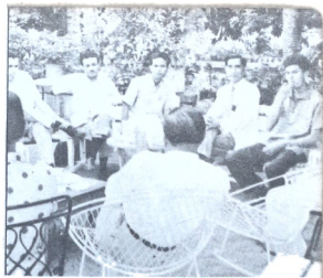
Foreign scholars relax with their professors.