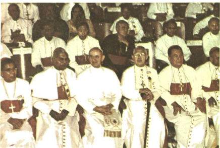
At the end of his address, Paul VI posed with the cardinals and bishops of Asia in this rare photo.