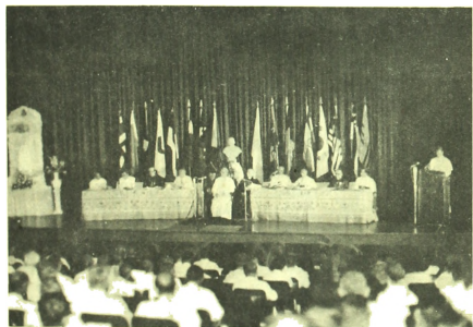
Flanked by the Presidents of the various Episcopal Conferences of Asia, Paul VI presided during the closing session of the Asian Bishops Conference on November 28, 1970.