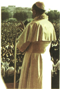
Upper photo, Pope Paul VI arriving at the UST campus amidst cheers of some 50,000 students; Lower right: Pope Paul VI greeting the students who gathered at the UST campus to hear his message to them last November 28, 1970; Lower left: after his speech Paul VI blessed the throng gathered at the UST campus.