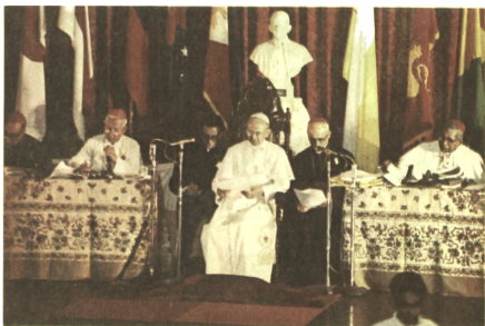
Pope Paul VI delivered a special message to the different bishops of Asia gathered at the UST College of Medicine auditorium.