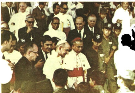
His holiness, Pope Paul VI engages some students in intimate conversation.