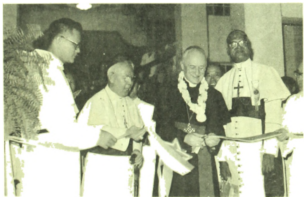
After the Mass the Papal Delegate to the Asian Bishops Conference opened the cultural and religious exhibits at the UST Main Library.