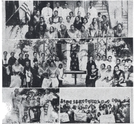
Top to bottom: Naguilian, Isabela; Piddig, Ilocos Norte; Janiway, Iloilo (left); and Bani, Pangasinan (right).