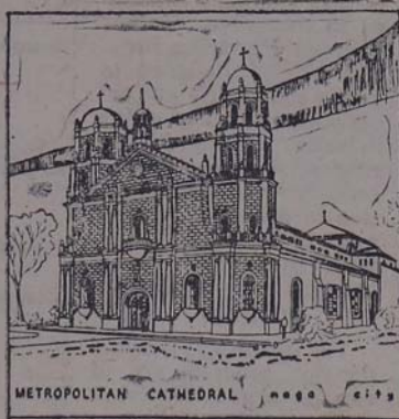
METROPOLITAN CATHEDRAL, NAGA CITY

All roads lead to the City of Naga, so to speak. People of all walks of life from different provinces of the Bicol region—from poblaciones and barrios of the towns are coming to Naga since last week when the traditional week-long religious festival, in honor of the Patroness of the Bicolanos, the Virgin of Penafrañcia, which started from Friday during the "traslacion" or the taking of the Images of the Virgin and of the Divine Face of Christ, from the Penafrañcia Shrine to the Metropolitan Cathedral where the "novena" for the Virgin runs for eight days, from Saturday to next Saturday, following