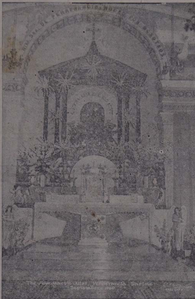
The New Marble Altar, Penafrañcia Shrine, Naga City