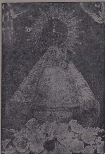
The Virgin of Penafrañcia