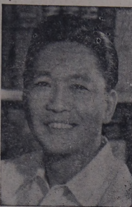
Pres. Marcos "Iriga, Camarines Sur May 17, 1968