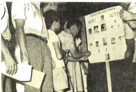
Were candidates sold according to personalities?

Of course, this is not to underestimate those who were elected by their own merits. As a matter of