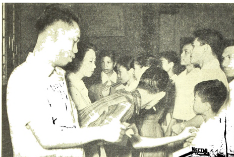
Isn't it electioneering?

T HE UNIVERSITY OF SAN CARLOS has fulfilled its mission in providing the students with the opportunity to learn good politics. The first semester of this year marked the establishment of the USC Supreme Student Council. The theories on government in a democracy that are taught in the classrooms can now be applied through this student government.