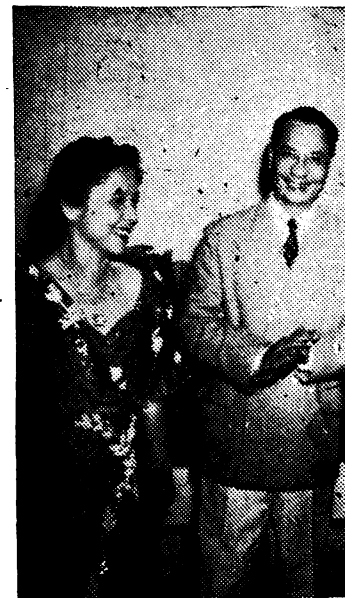
The late President and Mrs. Manuel Roxas.