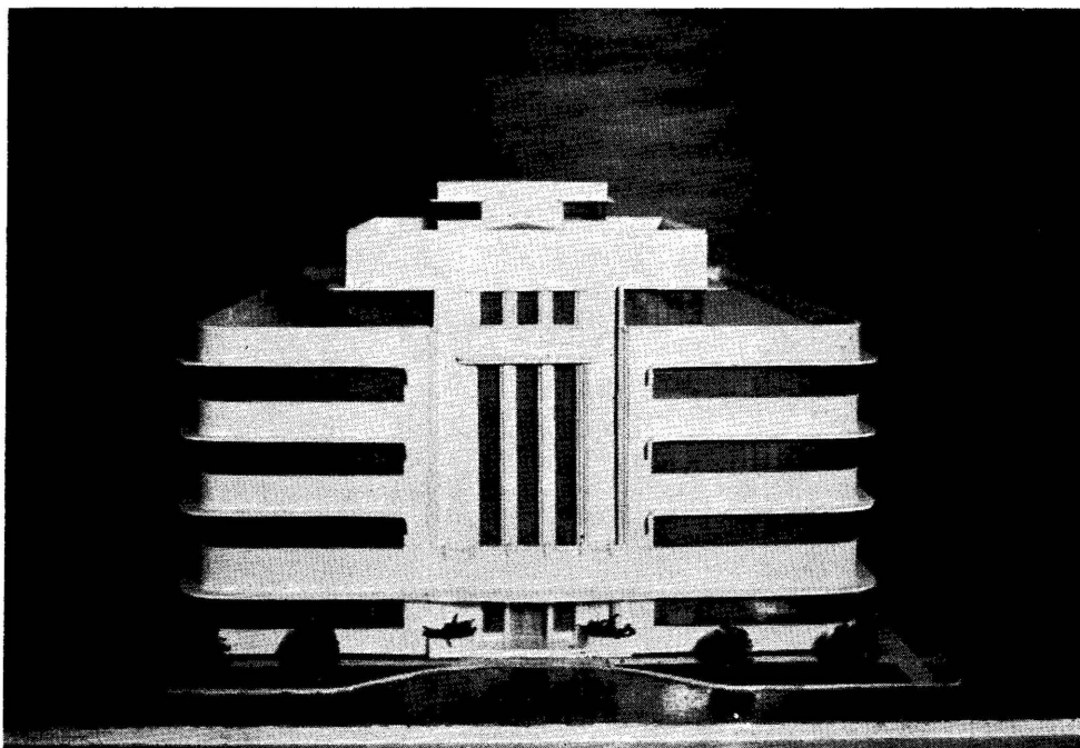
This is the front view of the model of the new Marsman Building. The structure is expected to be ready for occupancy in October.