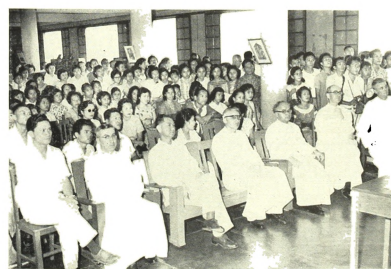
Part of the crowd that heard the President spoke.