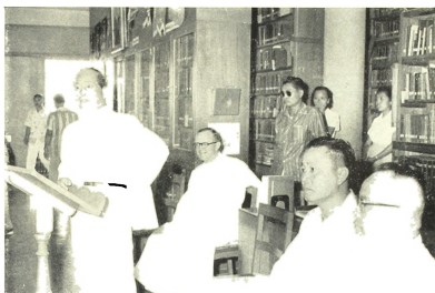
Carolynians listened to him.