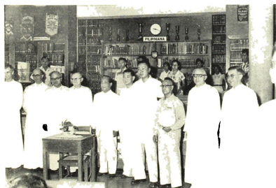
The President posed with the Fathers.