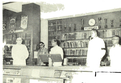
The Father Rector expressing gratitude to the President for his visit to U.S.C.