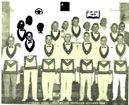
LEONARD WOOD LODGE NO. 105 INSTALLED OFFICERS 1958