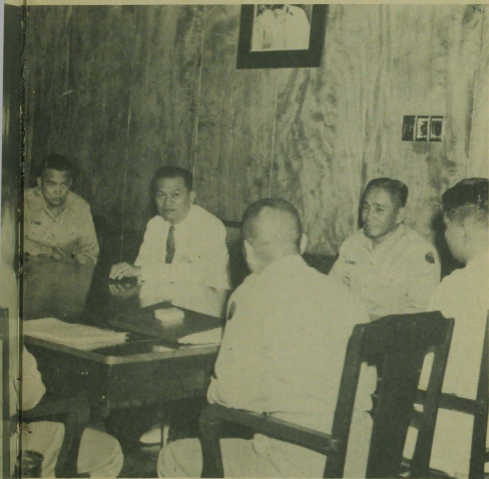
Photo above shows military top brass briefing the President on the result of the recently concluded SEATO meeting at Singapore.

so long as it has provisions for military defense. It is not the defense of actual battlefields which call for local counter-attacks along the line whenever pressed. All we signatories hope for is to stabilize present conditions and present boundaries. Our democratic principles, being against