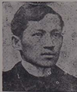
Dr. Jose Rizal

Malacanang announced the creation of the Lecture Committee which will coordinate all lectures to be given in connection with the commemoration of Rizal Day on December 30.