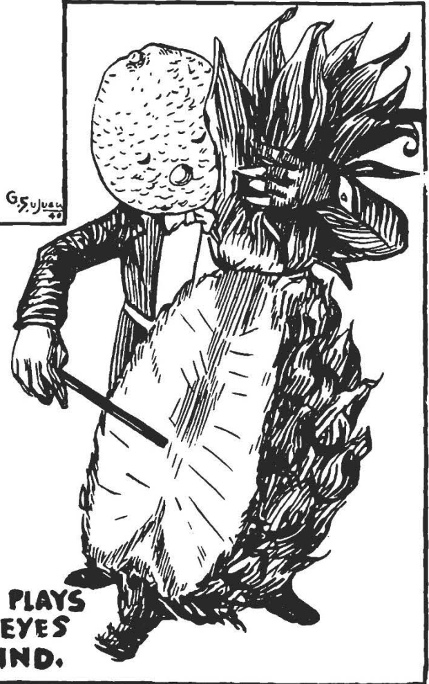
ORANGE-HEADED MUSICIAN PLAYS PINEAPPLE DOUBLE BASS. EYES ARE MADE BY CUTTING RIND.