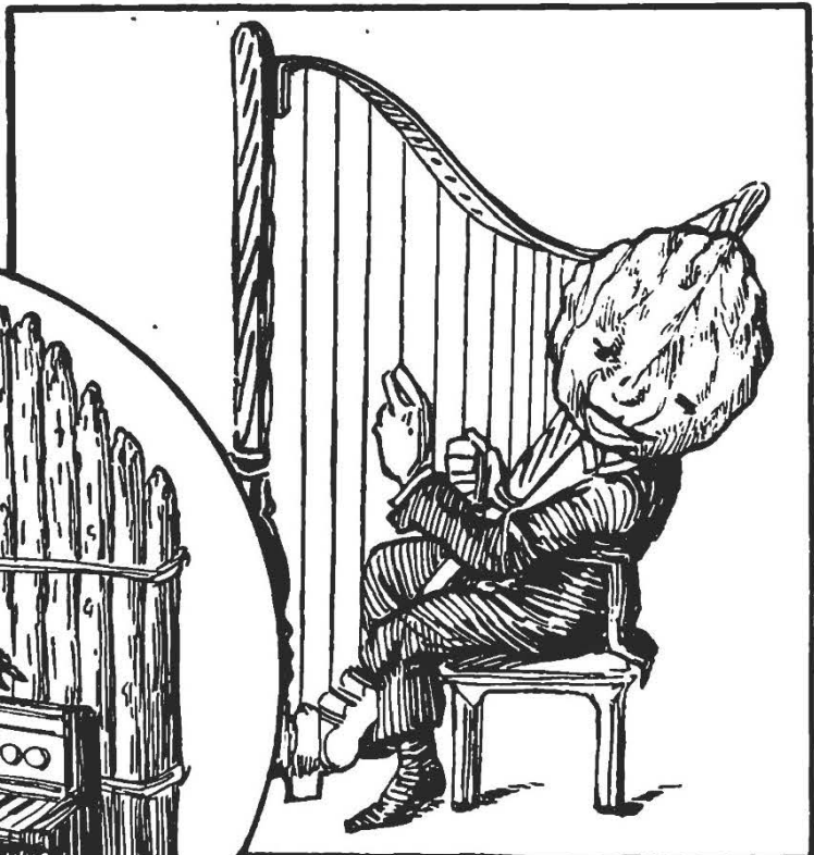
'NUTCRACKER SUITE': WALNUT HEAD PLAYS HARP, WHICH IS A NUTCRACKER.