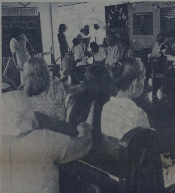
Adult education is as important a part of public instruction as is the conduct of the regular courses of study for schoolchildren in our public schools. Photo at left is a class in adult education, taught by regular public school teachers. Out-of-school youths (bottom, left) are also helped along in useful trades.