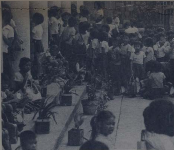
New work-oriented programs being pursued in public elementary schools are designed to develop in children an awareness of the value and dignity of work. This attitude is impressed upon the pupils early in the grades as the photos above and at right show. Below, dress-making and other home crafts are among the vocational subjects taught in the revised curriculum.