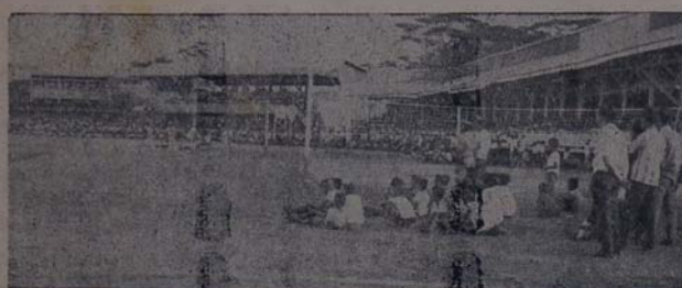
The picture here showing the huge crowd that filled the grandstands and bleachers at the Cam. Sur High School Campus.

Visitors Highly Applauded; Local Boys Did Best