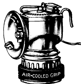
No. 807 Cap Lamp the new streamlined type; 2-1/2 hours of efficient light on one 2-ounce charge