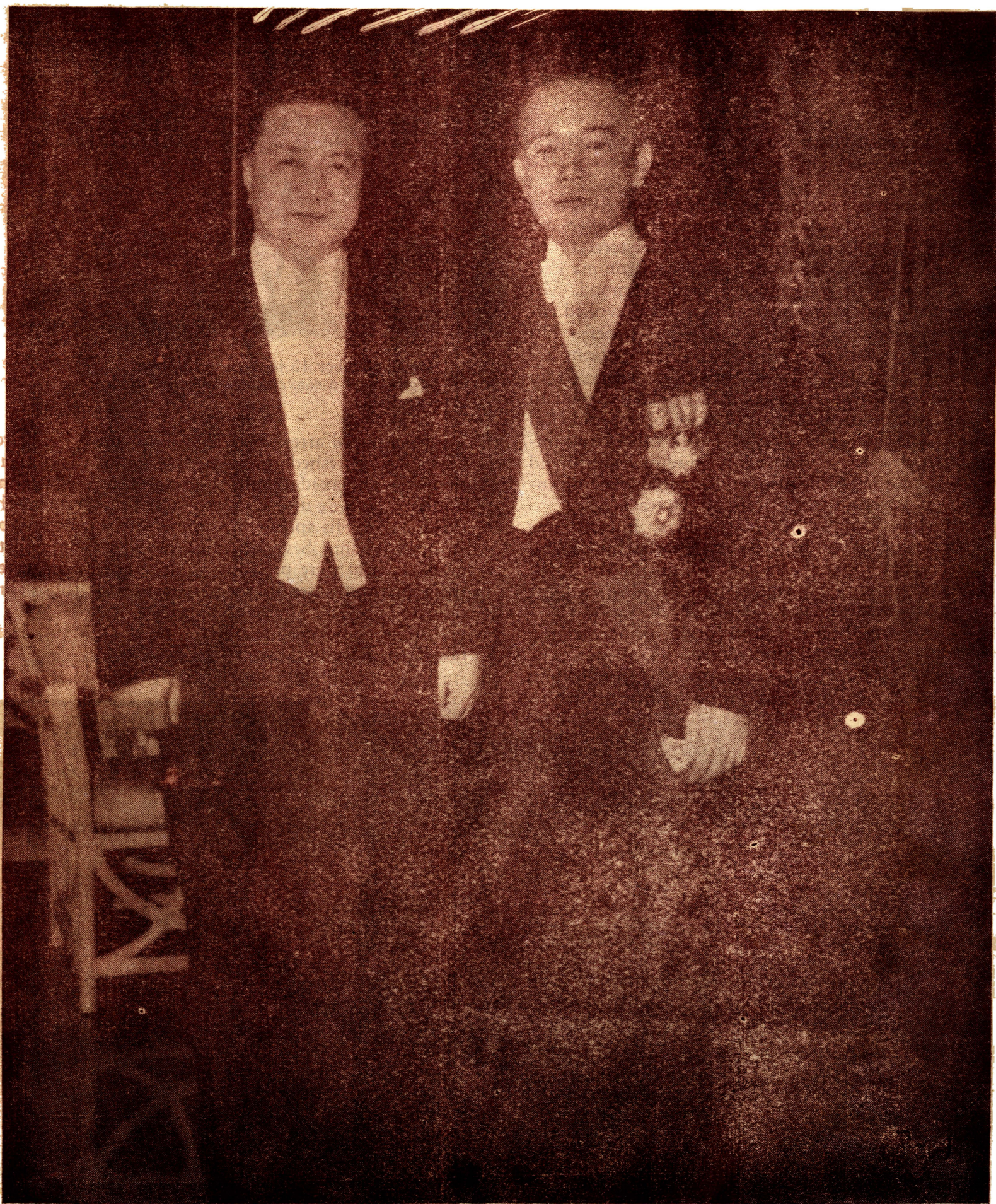
PI-Chinese Friendship President Elpidio Quirino, left and Chinese Minister Chen Chih Ping.