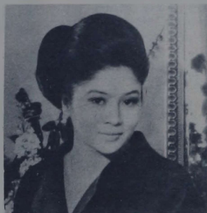
Mrs. Imelda Romualdez Marcos

To remedy this, Project Compassion was launched in November last year. A brainchild of the First Lady, it is a rural family development program integrating four major projects—nutrition, green revolution, family planning and environmental management—with the barangay network acting as organizational channel. It was planned by Mrs. Marcos' four foundations: the Nutrition Center of the Philippines, the Green Revolution, the Population Center Foundation and the Environmental Center of the Philippines.