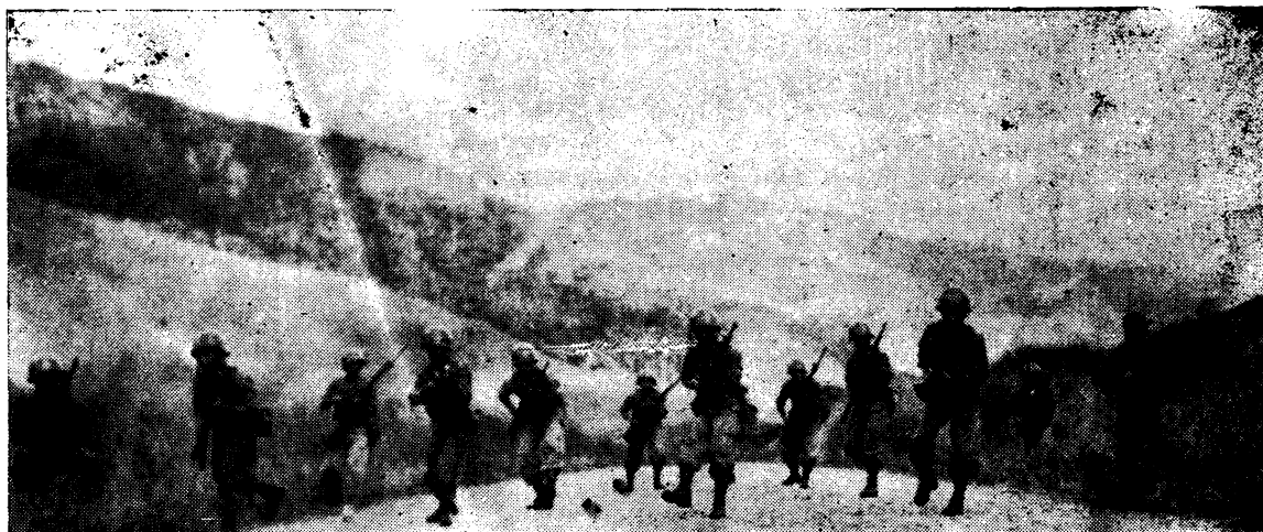
A "Nenita" group advances toward its objective, commando style, in the "Operations Arayat".