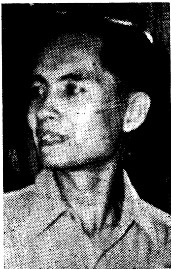
LUIS M. TARUC

FIFTH IN A SERIES OF THE "SKULL COMMANDOS"