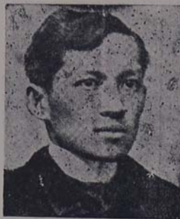
Dr. Jose Rizal