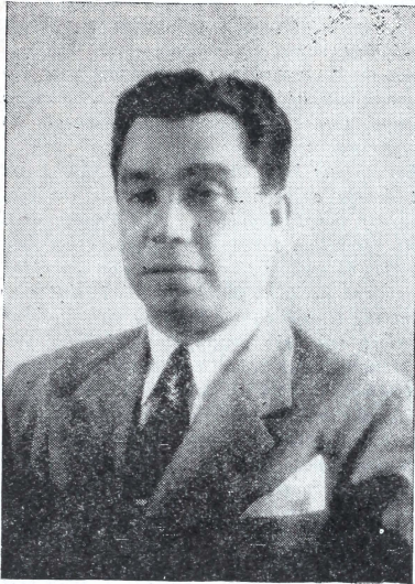
HON. JACINTO C. BORJA Provincial Governor of Bohol