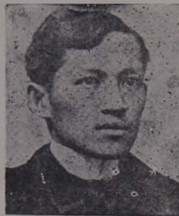
Dr. Jose Rizal

Malacanang announced the creation of the Lecture Committee which will coordinate all lectures to be given in connection with the commemoration of Rizal Day on December 30.