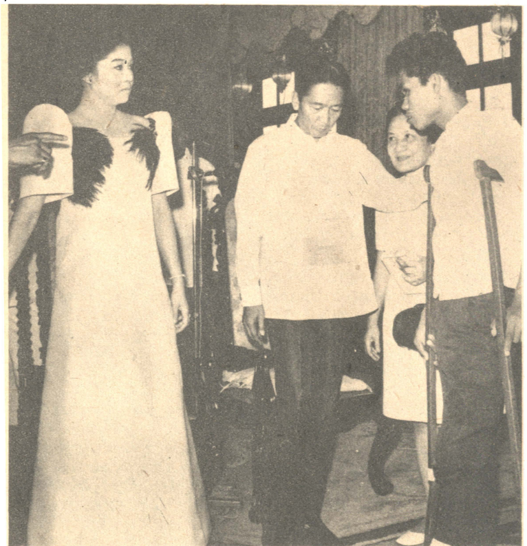
A cripple among well-wishers of the First Couple.

Malacañang than she started projects such as the "Share for Progress" (home garden movement), a nation-wide beautification campaign, the establishment of reception and study centers for children, of treatment centers for emotionally disturbed children, of orphanages and youth centers, of community centers, and of homes