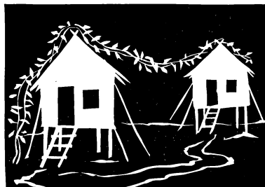
From original drawings by Pedro Felipe

the drip, drip, drip of the won—der—ful rain that lulls me to sleep.