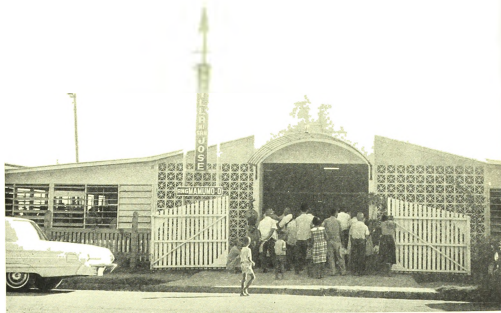
Front view of the St. Joseph's chapel of the San Carlos Center for the poor blessed by Archbishop Rosales of Cebu on August 15.