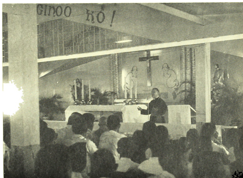
After the Holy Mass, His Excellency Archbishop Rosales addressed the people present.