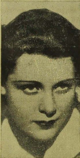
★ FRANCES DEE ★ featured in Paramount's "NIGHT OF JUNE 13TH" ★ Max Factor's Make-Up used exclusively.

★ FOR THE STARS of the screen... and for you... Max Factor, film-land's make-up genius, created make-up in color harmony to individualize the natural beauty of each complexion. A make-up ensemble... powder, rouge, lipstick, eyeshadow and other requisites.