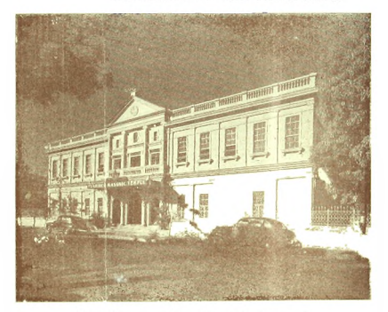
HOMI, OF THE GRAND FODGE 1110 San Marcelino, Manila