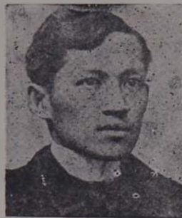
Dr. Jose Rizal

Malacanang announced the creation of the Lecture Committee which will coordinate all lectures to be given in connection with the commemoration of Rizal Day on December 30.