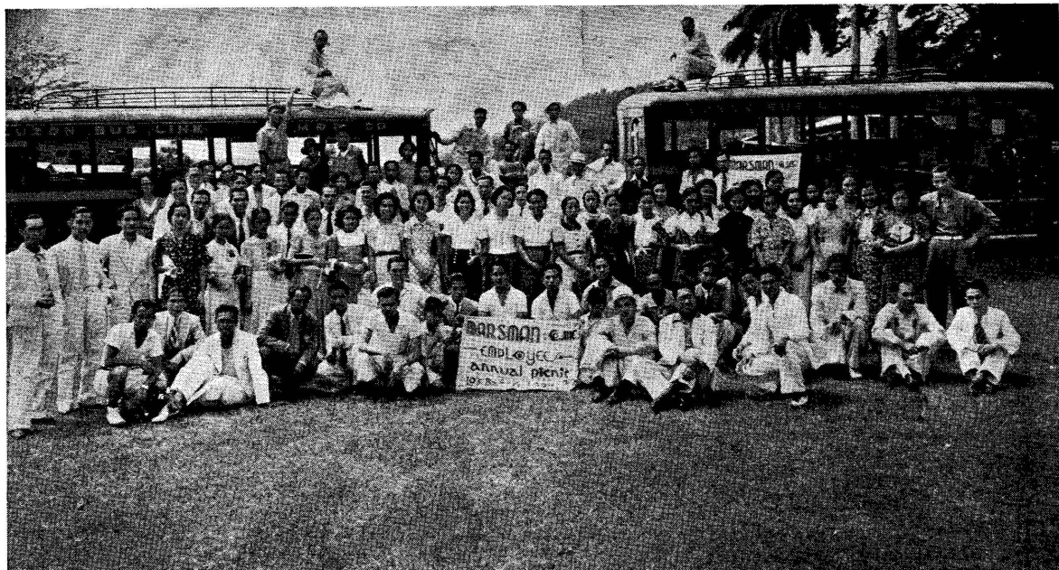
About 120 members of the organization and their families attended the affair, which was held April 18 at Los Baños.