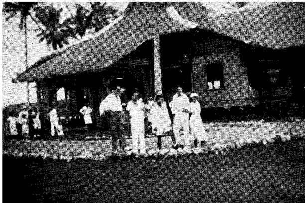
A group in front of the Paracale Country Club on May 15th during the height of the sports weekend festivities.