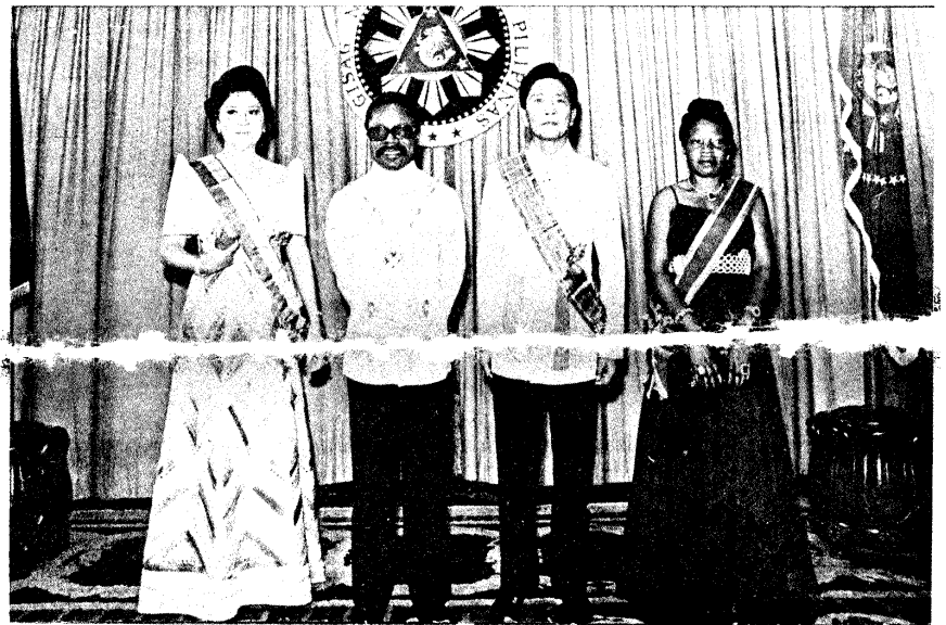
(Welcome remarks of President Marcos at the Manila International Airport on arrival of President Bongo of Gabonese Republic)