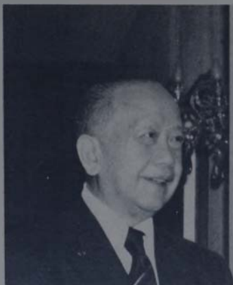
Secretary Romulo: a sound for unity.

Ironically, the testimony of Asian unity emerged from what was earlier billed as a make-or-break session. There had been speculations in the foreign press that the Philippines would use the meeting to condemn