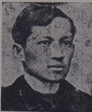
Dr. Jose Rizal